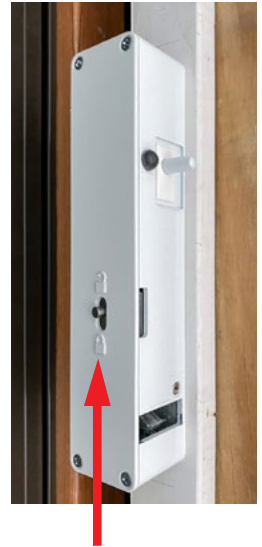
Internal locking mechanism