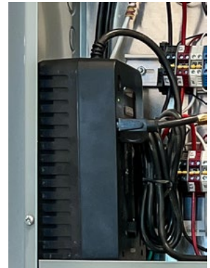
Battery Lowering UPS

NOTE: The cab gate must be closed after exiting the cab. If the gate is left open, the elevator controls will not work.