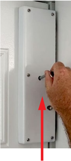
Insert at a downward angle