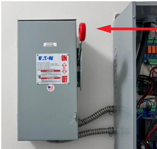
Emergency power disconnect