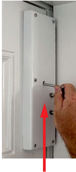
Pull down to unlock