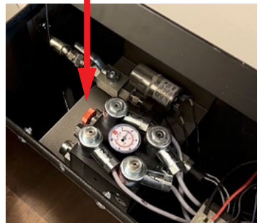
Manual lowering knob