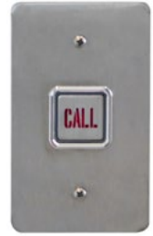
Hall Call Button

Once the home's power is restored, the back-up system will turn off and automatically begin recharging.